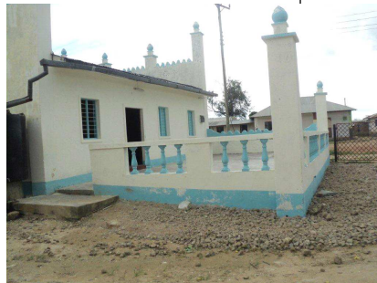
Guru Guru, Tsangatsini Before and After renovation

Amongst the innumerable blessings in the Holy month of Ramadhan, Dua is accepted by the Almighty at the time of Iftar. Make lots of Duas for yourself, the Ummah and JTQ. Sehri/Suhur is an important time as it enables one to wake up in the later part of the night and manage night prayers (Qiyamul Lail), spend time in reciting the noble Quran, doing Zikr as well as fajr prayers with congregation. Let us use this opportunity to reform our lifestyle. Ameen.