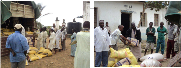
2013 Iftar Delivery