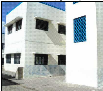
Darul Ulum Madrassa

to resolve the impasse, it became clear that an ulterior motive was involved. That of a take over of the centre. Regrettably, it seems the group enjoys some sort of patronage, as the 'group' last year forcefully fought back an official eviction order being implemented by JTQ.